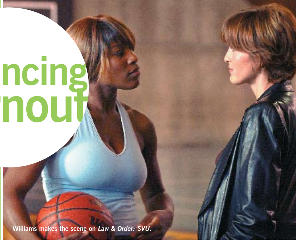
Williams makes the scene on Law & Order: SVU .

Not only that, what Simon calls "activating a stress response" in the body can hamper health in numerous ways, including increased blood pressure and heart rate, a weakened immune system, stomach upset, back pain, and trouble sleeping.