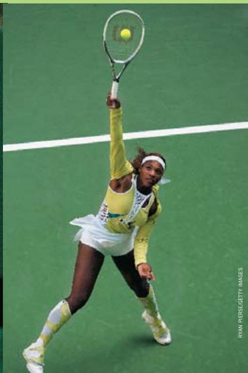
RYAN PIERSEGETTY IMAGES