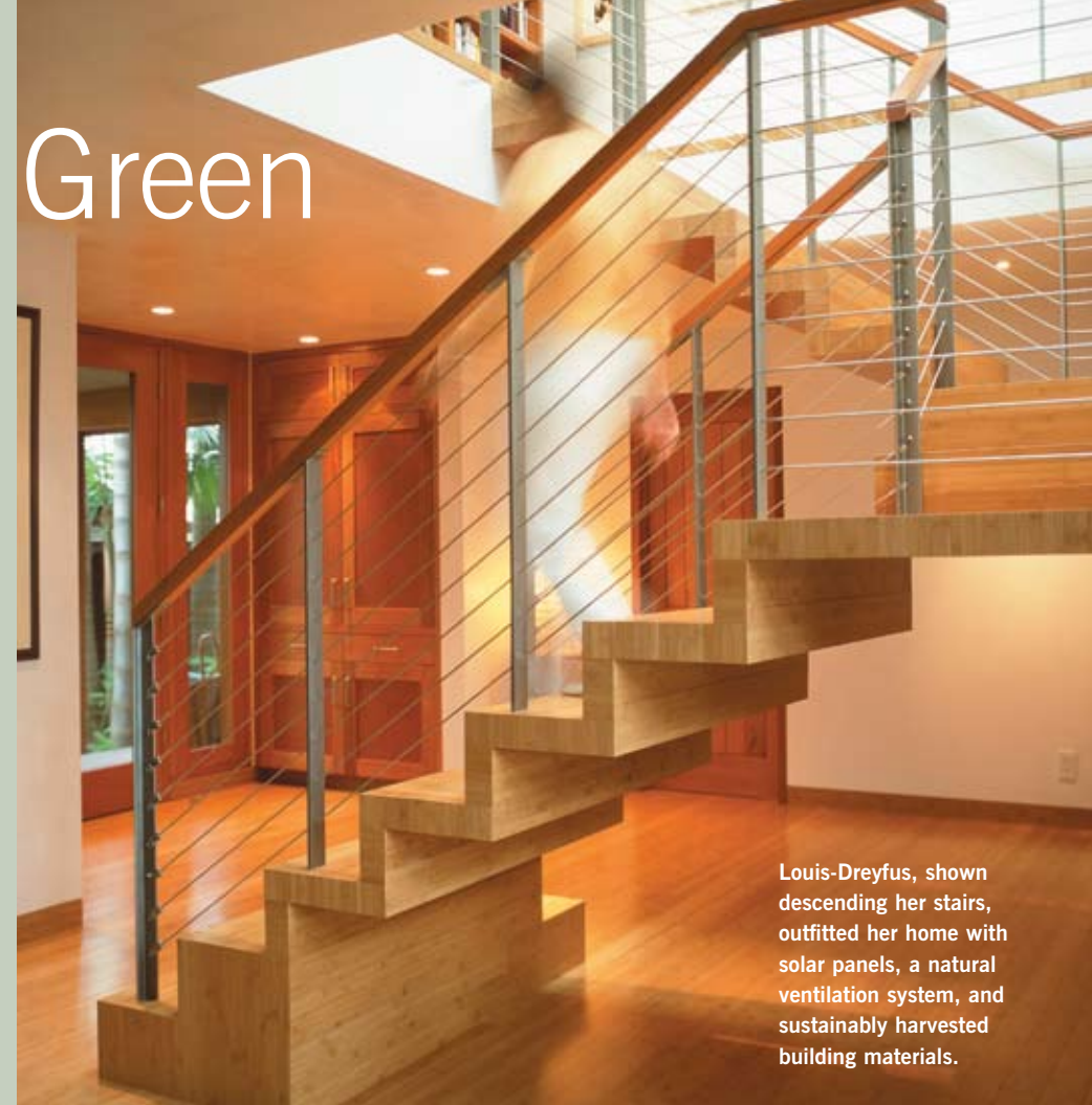
Louis-Dreyfus, shown descending her stairs, outfitted her home with solar panels, a natural ventilation system, and sustainably harvested building materials.

Buy smart. "Julia and Brad purchased Energy Star [a program developed by the Environmental Protection Agency] certified appliances—such as refrigerators and dishwashers—and they really make a difference, energywise."