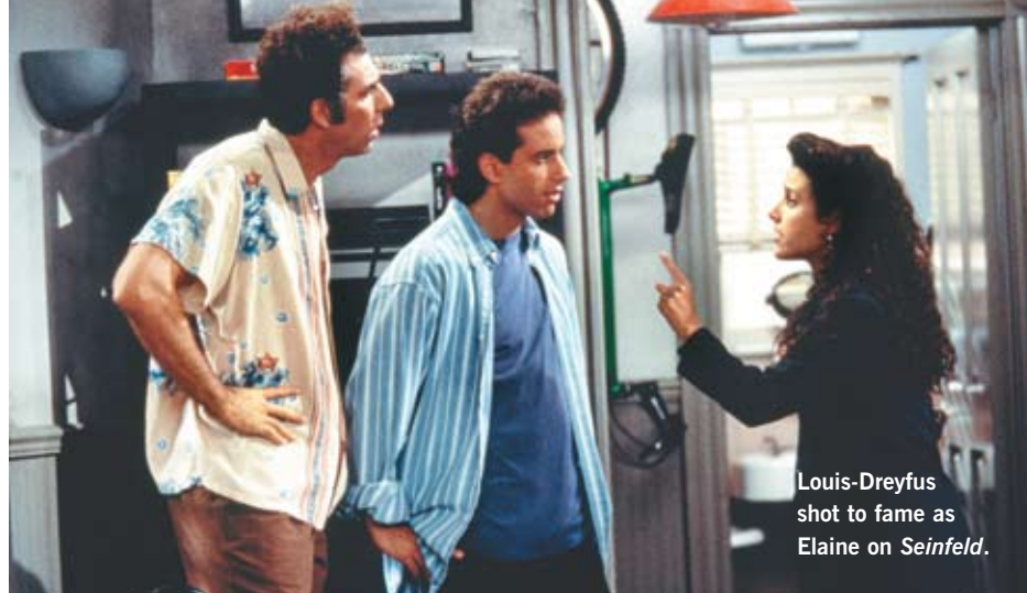
Louis-Dreyfus shot to fame as Elaine on Seinfeld .

"I got lucky. I guess my instincts were good. He's a wonderful, wonderful man."