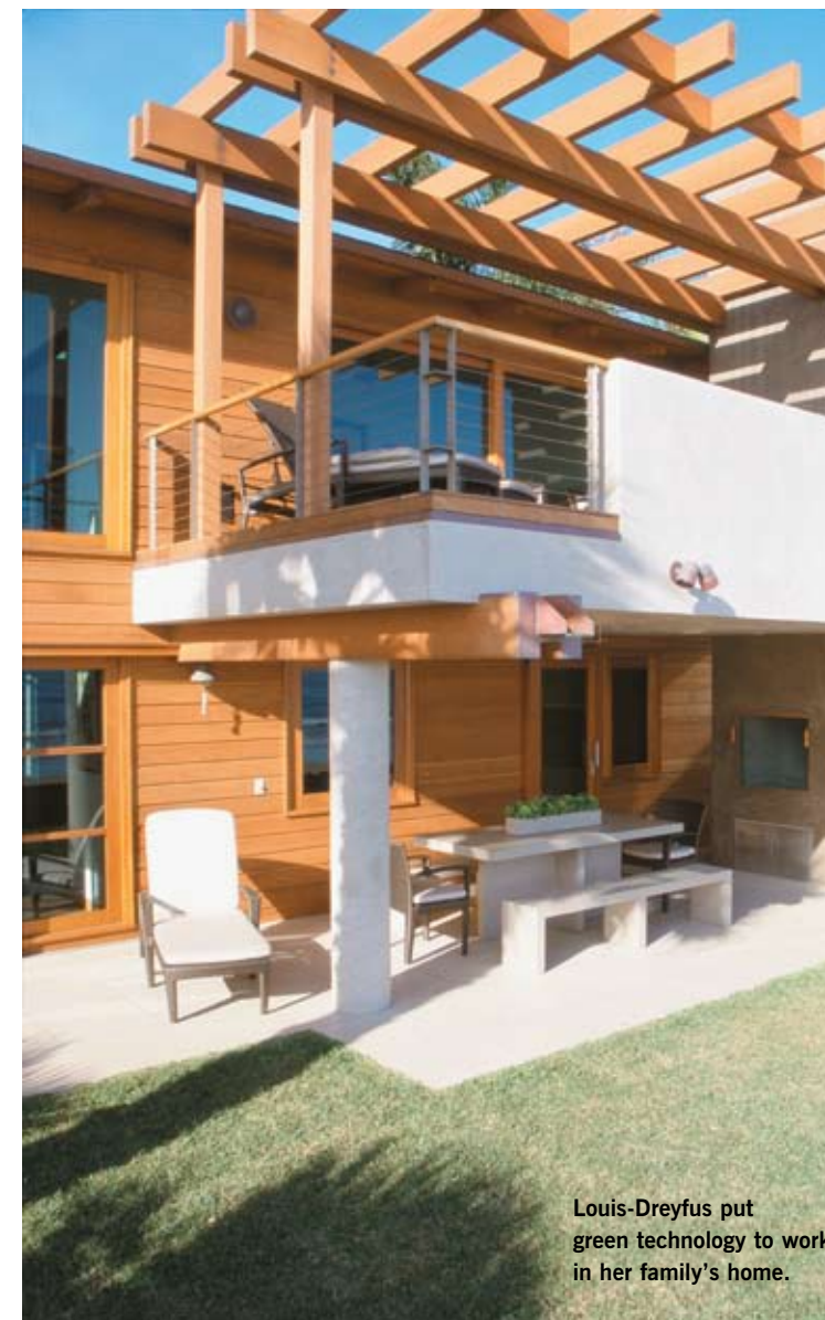
Louis-Dreyfus put green technology to work in her family's home.

She may make her living as one of TV's funniest women, but Julia Louis-Dreyfus is nothing but serious when it comes to raising two strong boys, putting her family first, cleaning up the planet, and helping the rest of us go green